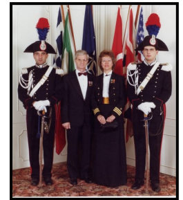
Bagnoli, Italy, 1992