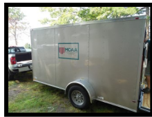
MOAA-NH Clambake Trailer PNSY, 2019