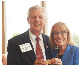
Sen. Maggie Hassan (Rt.)