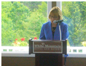
Senator Hassan White Mtn. Hotel

See more at: http://www.moaa.org/Content/Publications-and-Media/Press-Releases/Detail/MOAA-Responds-to-President-s-Proposed-FY-2018-Defense-Budget.aspx