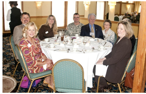
Head Table, "Promises To Keep" Derry, NH

All Formal complaints MUST be investigated per Army Regulation 600-20. Informal complaints are not investigated, but the victims are afforded all medical and psy-