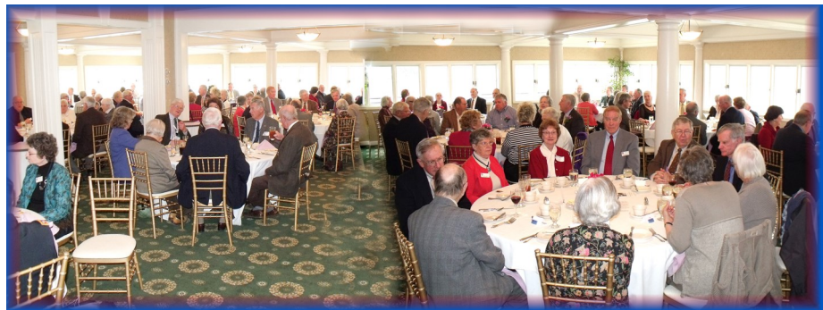
Abenaki Country Club Dining Room