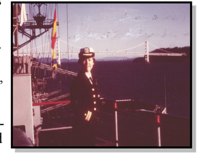
"Yes, I'm not driving the ship!" (USS CORAL SEA, ca 1977)