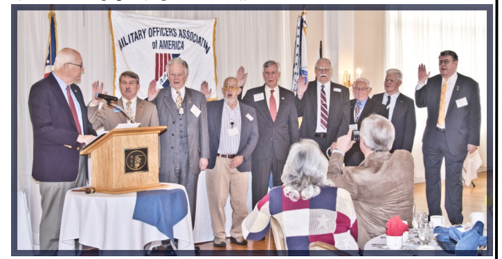
Chapter Officers swearing in